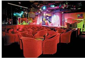
Cheetahs Gentlemen's Club